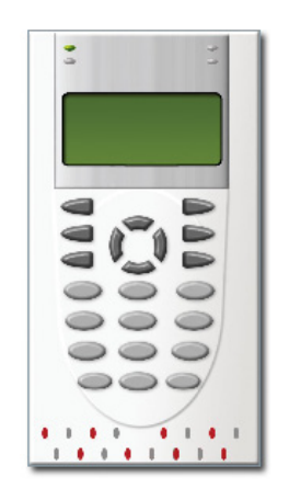
Figure 2: Typical Challenger user interface devices (RASs)

A device such as a Smart Card Reader is typically used for access control such as for opening doors. However, your Challenger system may be programmed to also use cards for alarm control, where an authorised user can disarm their assigned areas by presenting their card to a reader. The Challenger system can also be programmed to enable an authorised user to arm their assigned areas by presenting their card three times within a few seconds.